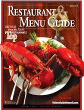
Publication Size 8 1/2 X 10 7/8